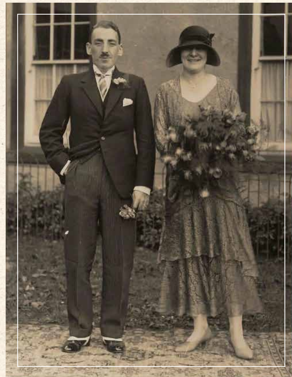
The Hogg - Gibson Wedding 1930