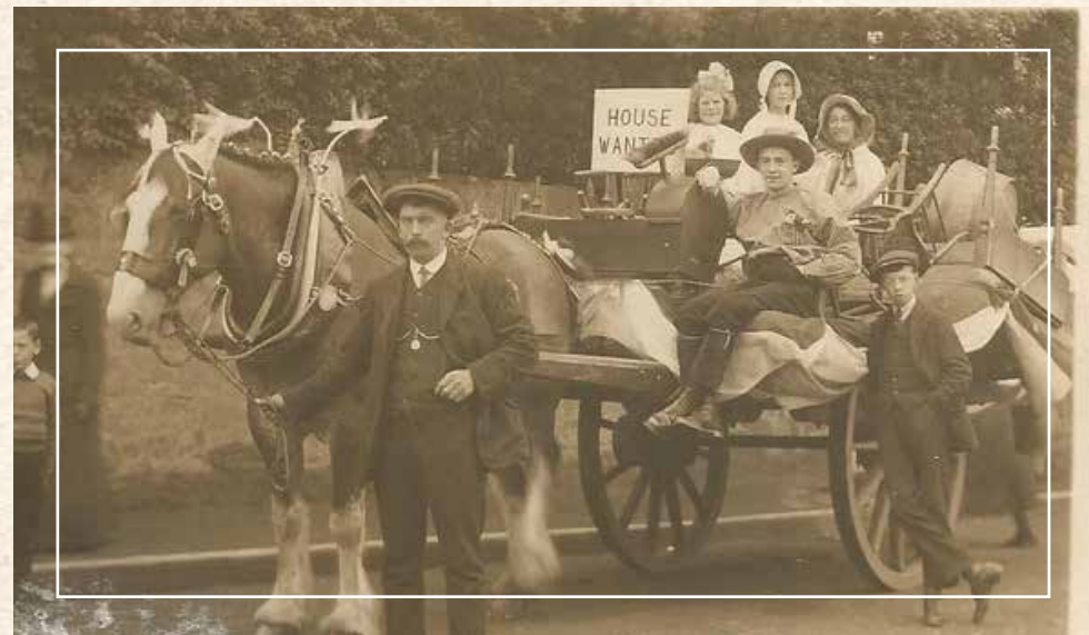
Cupar Peace Day. Circa 1919