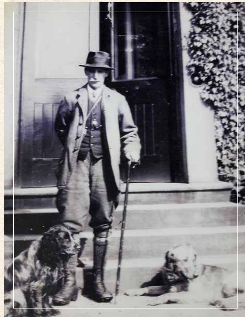
AT Hogg hobnail boots. Circa 1910