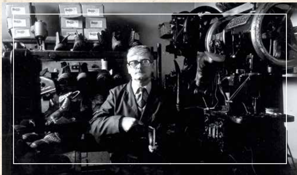
The finishing process. Circa 1982