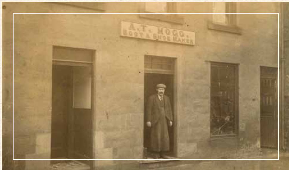
A second cobbler joins the business. Circa 1910